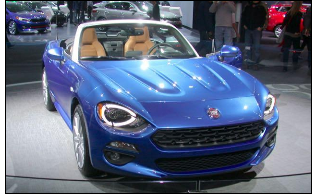
New FIAT 124.

Sadly, to me that indicates that an Alfa Roadster version was a fleeting anticipation.