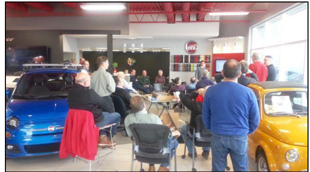
Tech Session at Alfa Romeo LaSalle.