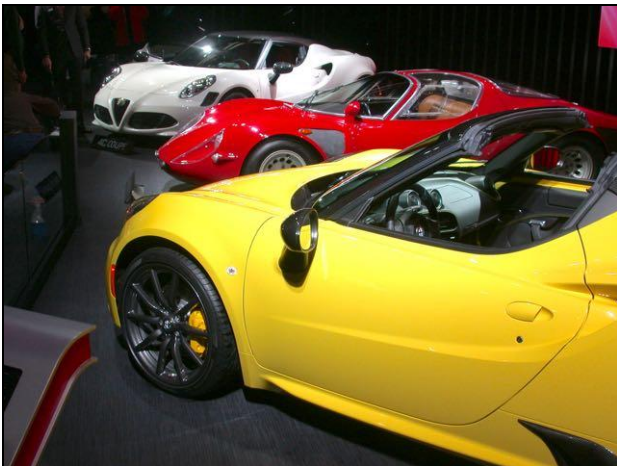
4C Spider and Coupe with 33 Stradale.

A Spider and Coupe version of the 4C flanked a spectacular 1968 STRADALE Tipo 33. I finally was able to get a 4C brochure!