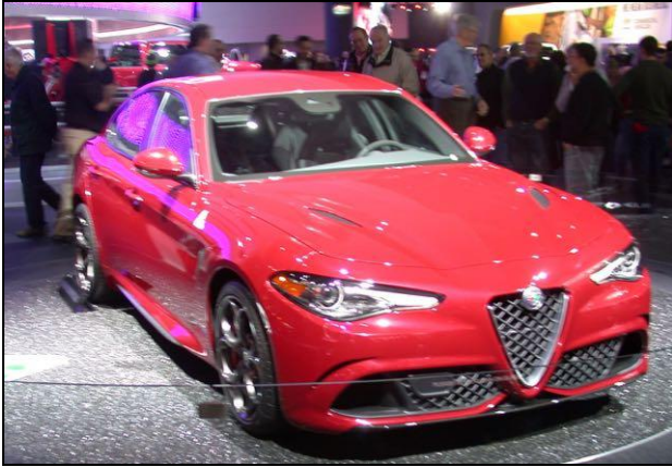
New Giulia Quadrifoglio.

transmission option, but apparently 4WD and “lesser” versions “will come later”. I was very concerned about the costly-to-replace carbon fibre lip front spoiler. With just five inches of clearance, it could become an unintentional snow plow and would certainly make careful parking against curbs imperative.