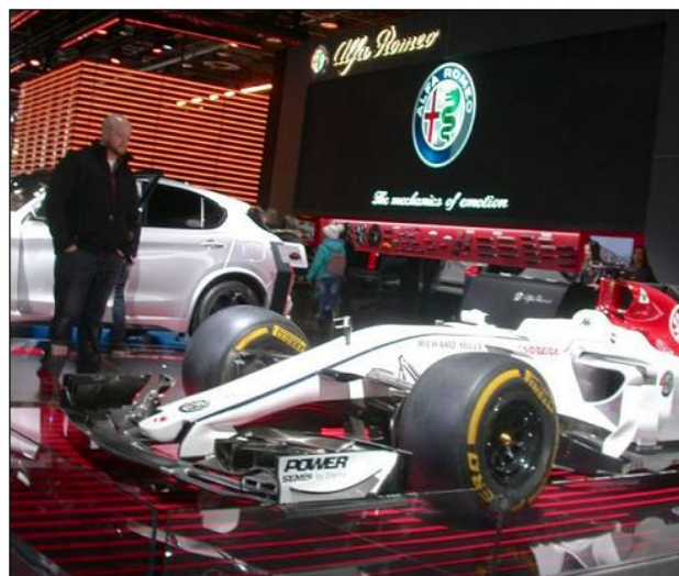
Alfa/Sauber F1 car.

Paddle shifters where everywhere. Luxury, "tech" and hyper horsepower was reflected in the price tags. Fiat had the whole lineup with a really nice 124 Abarth Spider. The Alfa/Sauber F1 display drew a lot of attention. To me the hit of the show was a black 1964 VW Beetle in concourse condition.