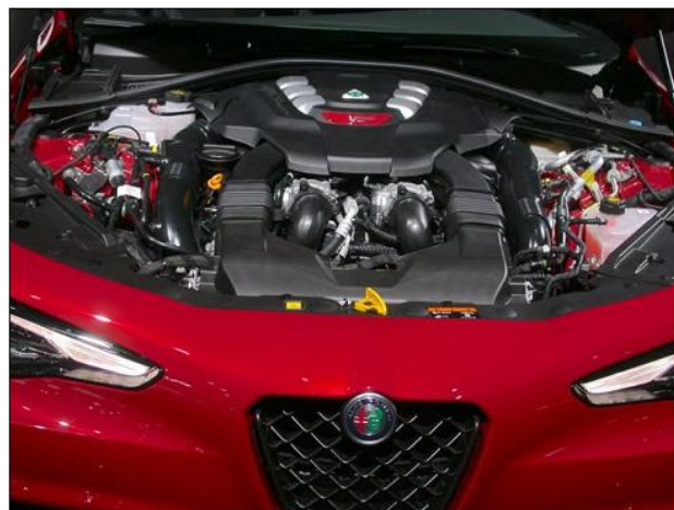
Note the yellow plastic hood release – hardly good for longevity.

Alfa Romeo had its full line of Giulias and a couple of Stelvios, one of whose hood could not be opened. My guess is the plastic hood latch release was to blame. see picture of open hood below).