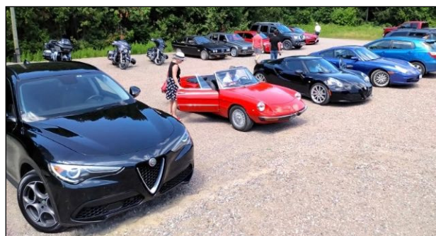
Sunday drive, July 26.

A scenic late afternoon drive along Lake MacGregor and beyond is very likely.